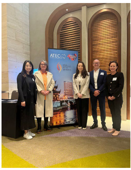
ATEC's China Host workshop training program launch, Perth.

China's outbound tourism industry presents a significant opportunity for Australia's visitor economy. Australia is investing in its tourism industry by supporting programs that cater to the growing outbound Chinese tourism market and help Australian businesses capture a share of this market.