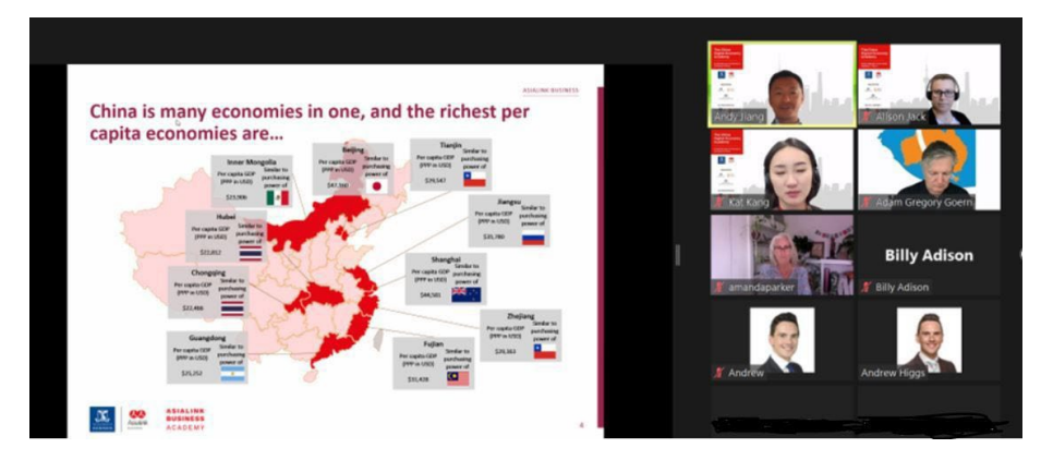
Asialink – The China Digital Economy Academy – online series Module 2.

Asialink's China Digital Economy Academy concluded its fourth and final round in October 2023. This program helped Australian small and medium-sized enterprises (SMEs) bolster their knowledge and capability to engage with China's booming e-commerce market. Over 300 organisations participated across the four rounds, gaining valuable insights into Chinese business culture, consumer behaviour, and digital marketing strategies. This initiative advanced Australia's national interest by empowering SMEs to tap into a vast market and foster stronger economic ties between Australia and China.