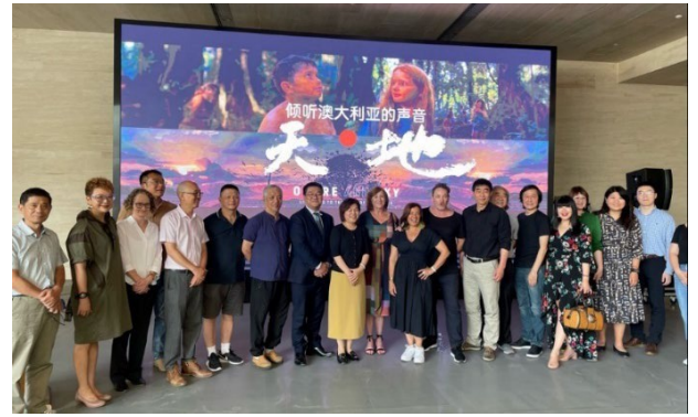
Ochre and Sky touring in China.

Showcasing First Nations' culture and the concept of Country, the National Museum of Australia's Ochre and Sky exhibition embarked on a roadshow across China in 2023 and 2024, supported by the Foundation.