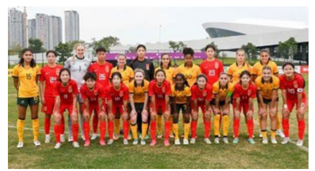
The Young Matildas in Xiamen.

In November 2023 the Young Matildas U20 team toured Xiamen, building skills with their Chinese counterparts in preparation for the Women's World Cup in 2027 and as Australia prepares to host the 2032 Summer Olympic Games in Queensland. The trip included visits to a <u>local school</u>, UNESCO World Heritage Site Gulangyu, and <u>two</u> <u>livestreamed friendly matches</u>.