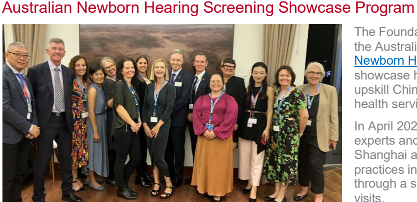
The delegation was received by Australian Ambassador to the

The Foundation is pleased to support ACYD and cultivate the next generation of informed and engaged professionals who will actively contribute to a constructive Australia-China relationship.