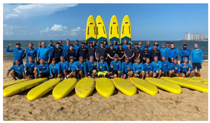
Surf Life Saving NSW & QLD delivered aquatic emergency training to frontline responders in November 2023 in Haikou, Hainan.

In Haikou, the Chairman represented the Foundation at the <u>first international training activity run in China</u> by Surf Life Saving NSW and QLD. In partnership with the Haikou Emergency Centre, Surf Life Saving NSW and QLD delivered <u>aquatic emergency training</u> to 40 first responders from across China. Additionally, they produced a bilingual aquatic rescue manual to support future training and development for Chinese emergency personnel.